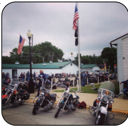
The first stop on the Ride was Wolfey's Outback in Quasqueton, Iowa. The official count of motorcycles was 123 at this stop.

All proceeds from the Memorial Ride and Drive will be split between the Angel's Memorial Park at Meyer's Lake in Evansdale, and Cedar Valley Crimestoppers.