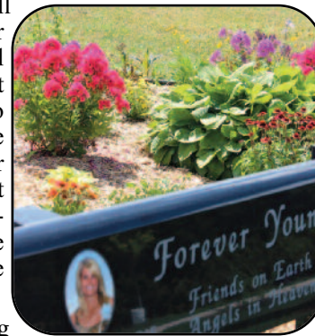
Marble benches have been donated by some families as a memorial to their loved ones.

The flower beds will be maintained by volunteers in the community. Many of the flower beds have been spoken for, but