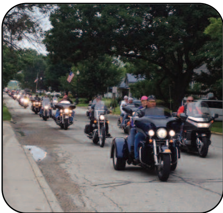
The clouds began to disappear during the ride to the second stop in Hopkinton, Iowa. More bikes had joined the ride, but no official count was taken. An official tally of the Ride and concert is not yet available.